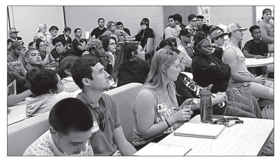
Students listened intently to the presentation.

reading. "Literature sparks imagination," she said.