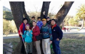
2013 con hija, esposo y nietos

Discussion includes why they must stay involved in their education, how it feels when child leaves home for college and most importantly why they must prepare to let them go after graduation to become scholars. Family informally discusses how positively life turned out because child left home on scholarship to study at Berkeley, despite initial pain. Superintendent of C & I who first saw it said, "This is EXACTLY what today's immigrant parents need to hear - about preparing their kids and learning to let them go."