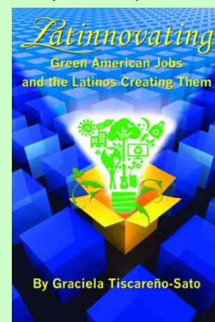
Latininnovating ISBN: 9780983476009